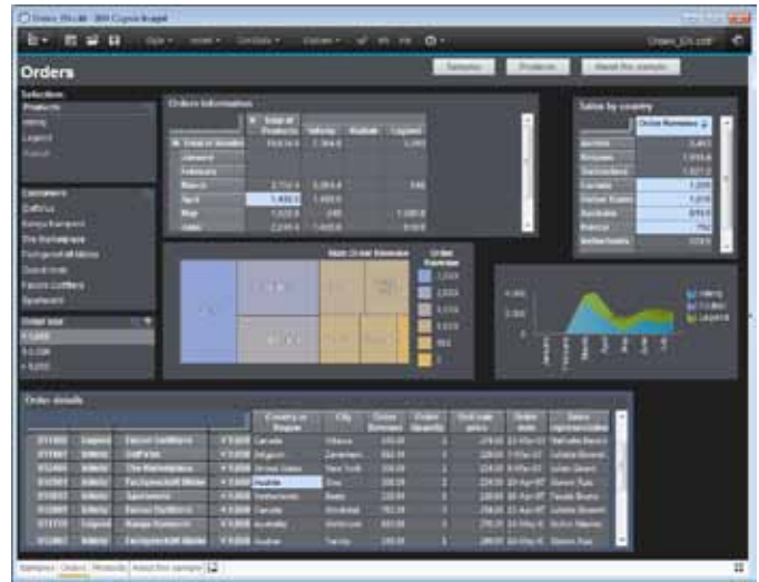
Figure 3: “What-if” scenario modeling lets you analyze and optimize your plans based on different assumptions that take into account ever-changing market conditions.

To easily navigate through large data sets with multiple dimensions, you can filter results based on the association between related groups of information. You can even apply a simple search to these explore points to further drill down to a particular member in a set and other information related to that member. When combined with visualizations, this powerful point-and-click approach allows you to quickly spot trends and identify outliers.