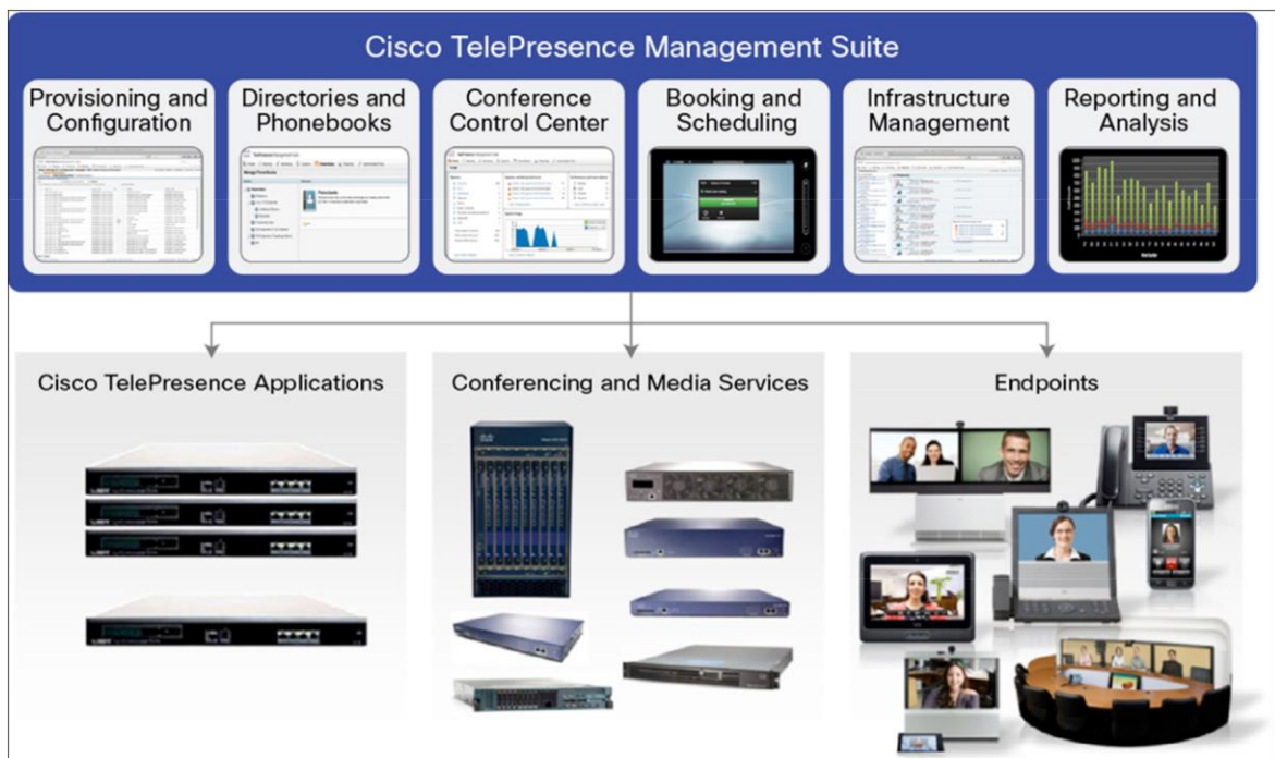
Figure 1. Cisco TelePresence Management Suite

Cisco TMS provides you with scheduling, control, and management of Cisco TelePresence conferencing and media services infrastructure and endpoints, enabling you to improve productivity, reduce costs, and increase return on your Cisco TelePresence investments (Figure 1).